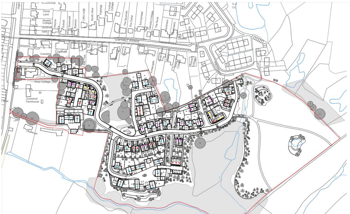
Figure 2: Proposed Site Layout Plan (drawing ref. DE284A_003 Rev D) Extract – approved under planning permission ref. 20/02788/FULL