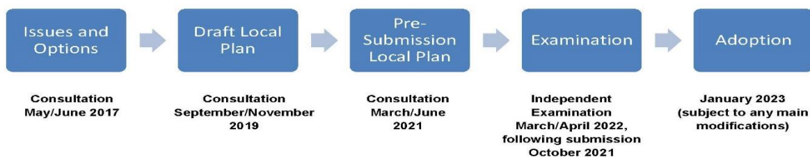
Figure 1: Local Plan timescales

1.7 Full details of the Local Plan timetable are set out in the latest Local Development Scheme (LDS) Local Development Scheme .