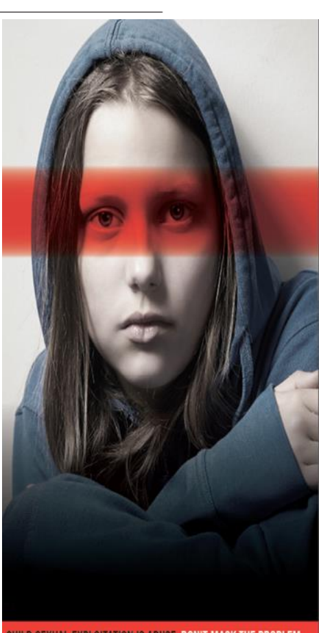
CHILD SEXUAL EXPLOITATION IS ABUSE. DON'T MASK THE PROBLE

It's a process of grooming where the abuser targets a child's vulnerability, makes them feel loved or wanted as though the relationship is normal when in fact the child is being controlled through intimidation, fear or violence